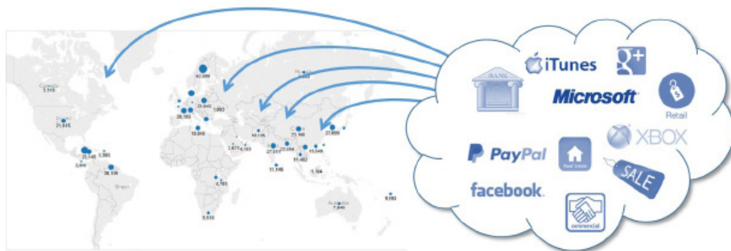
Figure 1 – Example Grey Route Traffic Flows